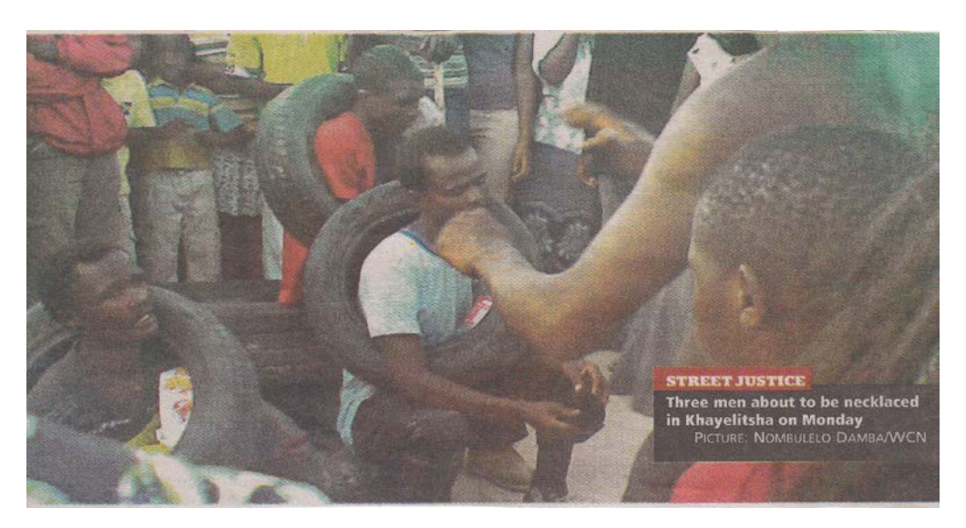
Figure 4: Three criminal suspects waiting to be necklaced in Khayelitsha