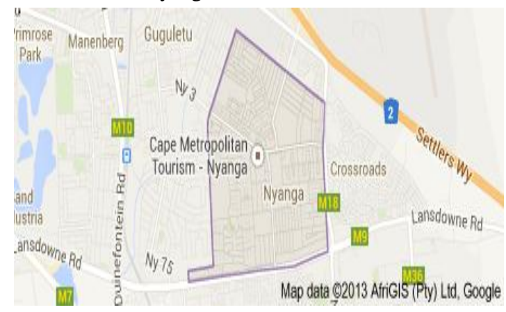
MAP 2: Nyanga Junction