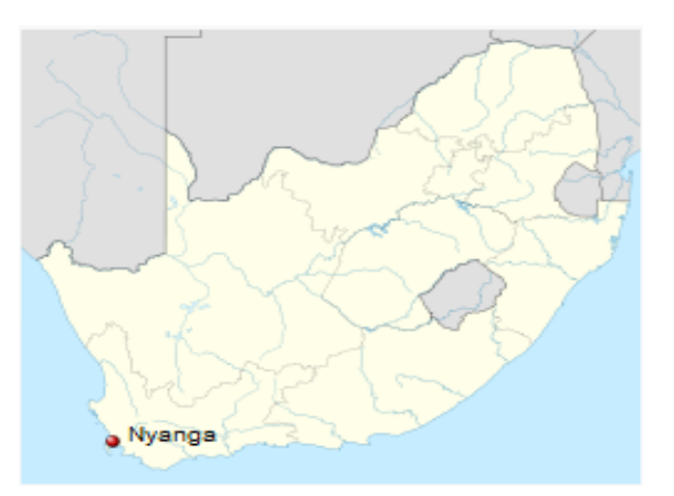
MAP 1: Location in South Africa