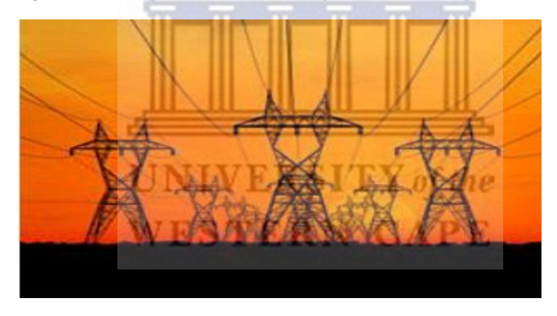
Figure 2.1: Power lines that transmit electricity

Power stations generate electricity which is being transmitted through power lines that are all over the cities, the rural areas and are also along the road for everyone to see (Eskom, 2015). The power lines that carry the electricity can be seen in the figure below.